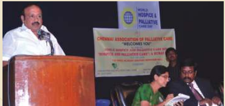
function at chennai

Chennai Association of Palliative Care (CAPC), RMD Pain and Palliative Care Trust, Lakshmi Pain and Palliative Care Clinic together organised a public awareness programme .