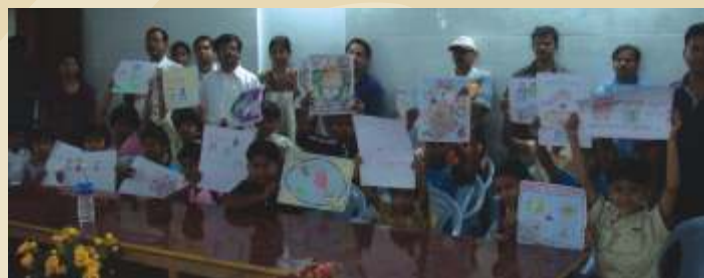
A painting competition for children was organised by Acharya RCC Pain clinic cuttack.