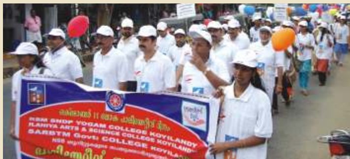
Rally at quilandy