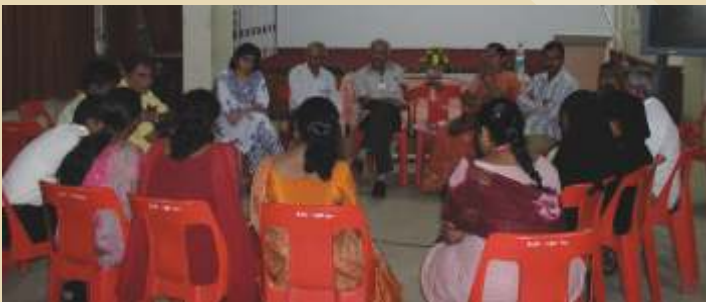
Get together at st John's hospital, Bangalore