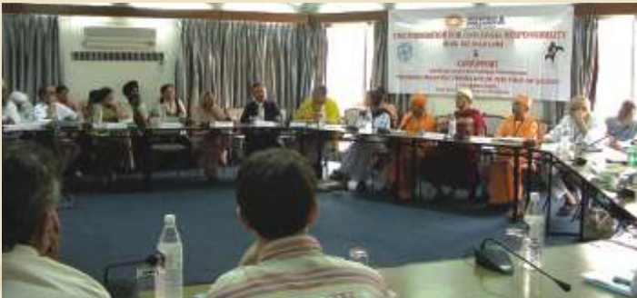
Workshop at CanSupport

CanSupport and the Foundation for Universal Responsibility of His Holiness The Dalai Lama marked World Hospice & Palliative Care Day by organising a full day workshop at the India International Centre in Delhi. CanSupport also published a souvenir on the occasion in keeping with this year's theme.