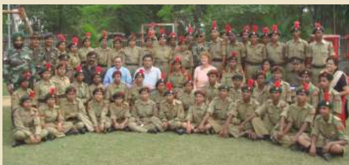
NCC cadets who had completed training in palliative care at Bokaro

A volunteer training programme was launched at KOSHISH.