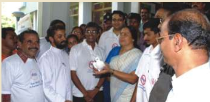
Health minister of Kerala P K Sreemathi releasing doves at RCC Thiruvananthapuram.

Health Minister of Kerala P K Sreemathi participated in world hospice and Palliative care day celebration at Regional Cancer center, Thiruvananthapuram.