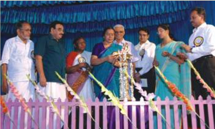
Inaugural function of NRHM Arogyakeralam Palliative Care Project

Kerala is the first state where Palliative care is being linked up with National Rural Health Mission (NRHM) programs and NRHM has initiated a state level project this year aiming at the development of community based care services for the bed ridden, elderly, chronically and incurably ill people in the state.