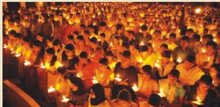
Santhwana Sandhya programme at Thiruvalla

Malayala Manorama, the Malayalam daily which organised a media campaign in Palliative care, observed the world Palliative Care Day at Thiruvalla in Pathanamthitta District. The programme 'Eve on alleviation' was organised on October 11th evening. Hundreds of people who gathered in the evening lighted the candles as a symbol of 'kindness and brightness' to the lives of those who suffer.